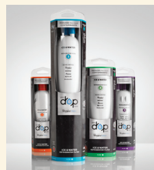
Ice and water filtration (FILTER2/EDR2RXD1)

Let members know that an EveryDrop™ filter is included with their new Whirlpool® refrigerator. Remind them to change their filters every six months to keep their refrigerator in prime condition.