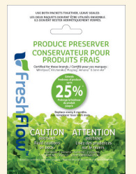
FreshFlow™ produce preserver (FRESH1/W10346771A)

Whirlpool Corporation is dedicated to social responsibility. Here are just some of the things we're doing to show our communities they matter and continue our commitment to develop high-performance appliances that conserve resources.