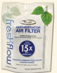
FreshFlow™ air filter (AIR1/W10311524)